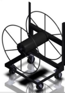
Floor Mount Kit